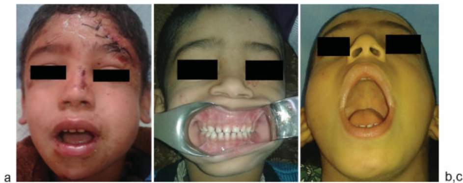
Fig. 5 A 5-year-old boy with left body fracture of the mandible (patient no. 4): (a) the patient at time of presentation 1 day after trauma. (b) 1 year postoperative photograph showing normal occlusion. (c) 1 year postoperative photograph showing full range of mouth opening.

The blunt tips of the biodegradable screws and their eventual degradation reduce the harm on the developing teeth particularly in young children in the primary and mixed dentition periods. Another advantage is that the