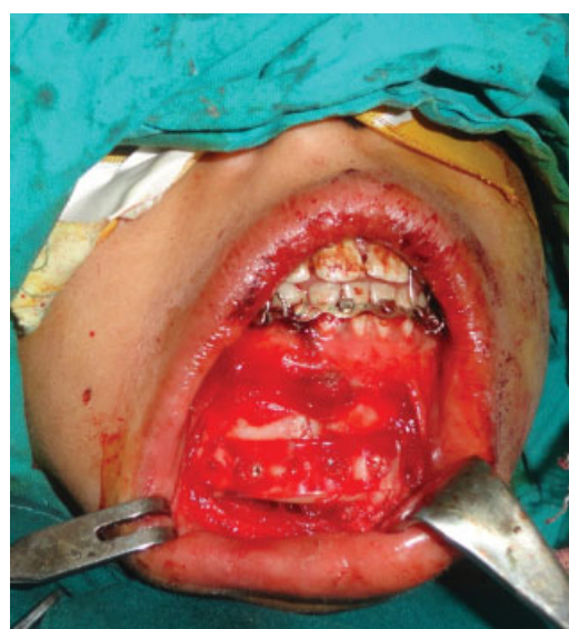
Fig. 2 Intraoperative photograph showing right parasymphyseal fracture of the mandible (patient no. 2) fixed with 2.5-mm self-reinforced poly-L/DL-lactide plate and screws through transbuccal approach.

In the period from October 2011 to February 2013, 12 children with mandibular fractures (►Table 1) were managed using the biodegradable plating system. The average age was 7.16 years (range from 3 to 12 years), nine males and three females giving male-to-female ratio (3:1). The time interval between the occurrence of trauma and surgical intervention was variable with an average of 2 days (range, 0–5 days). The etiology of the fractures was road traffic accident in 10 patients (83.3%) and falls in 2 patients (16.7%). These patients had 14 fractures (10 single and 2 double): 2 symphyseal, 6 parasymphyseal, 3 bodies, and 3 angle fractures. Fractures were undisplaced in three cases, slightly displaced in four cases, and severely displaced in seven cases. The mean hospital stay was 4 days. The number of plates used per patient ranged from one to two, and the number of screws from four to eight.