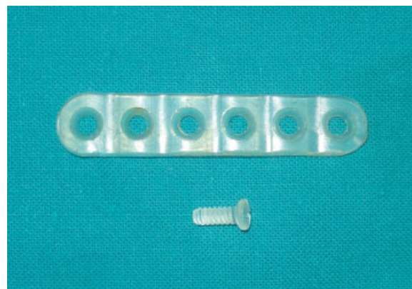
Fig. 1 INION (self-reinforced poly-L/DL-lactide) biodegradable 2.5-mm plate and screw used in this study.

The follow-up appointments were at 1 week, 6 weeks, 3 months, and 12 months postoperatively with the assessment of any wound complications as infection, dehiscence, and fistula formation, stability, displacement, malocclusion, mouth opening limitation, TMJ ankylosis, and disturbances of sensation. Radiographic follow-up by CT scan was done to observe any displacement and fracture healing at 1 week, 3 months, and 12 months postoperatively.